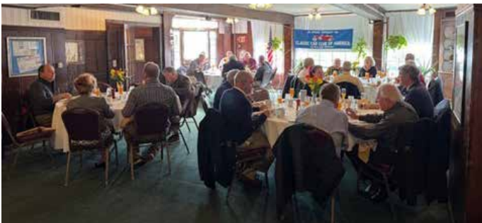
NER Members enjoying the Old Salt Restaurant buffet at the NER Annual Meeting