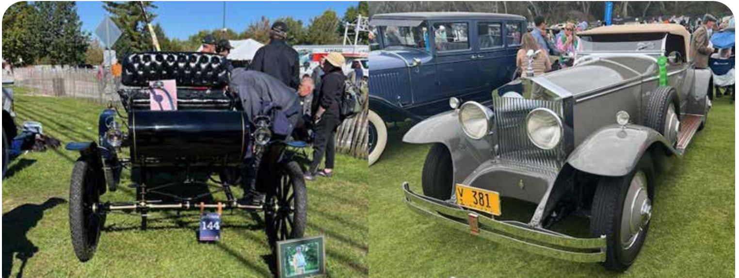
1903 Curved Dash Olds – The Bahre Collection at ACA Hershey Fall Meet 2024