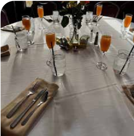
A perfect table setting for the NER 70th Anniversary Meeting at The Old Salt