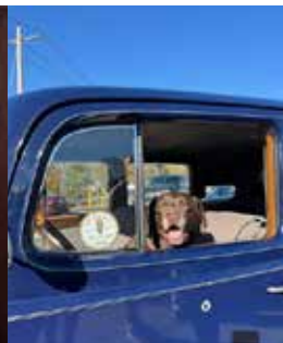
A beautiful "Autum" Day.