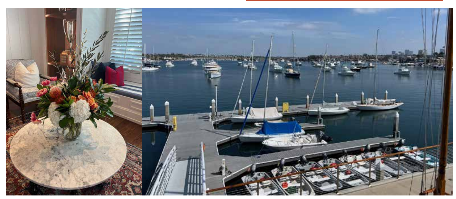
Flowers at the Yacht Club