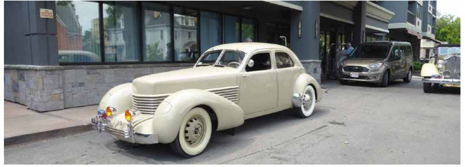
Final day Leaving Rochester Hotel.