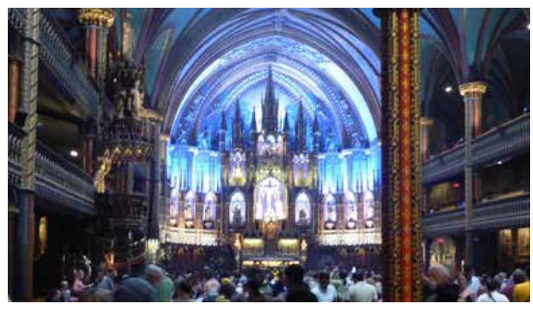
Light show in the Notre-Dame Basilica of Montreal.

an alley to an underground garage. We missed the alley turn, so up the hill again, and do the circle again. The outside temperature was now 95 degrees and our car temp gauge was out of sight. It was no problem going around the block again as we could follow our coolant trail left from the first time around! Finding the alley we went into the wrong garage door went up 1 level and had to back down and out. Finding the correct door we went down into a very constrained basement (note: the turning radius of front drive Cords are terrible) and in the maneuvering the engine quit. I tried to start Bev but the engine was locked up. Four hotel staff helped us push the car into a parking spot. Well she's parked.