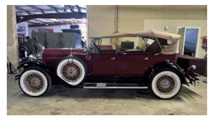
1930 Packard 733 Sport Phaeton