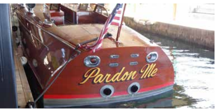
At the Clayton Antique Boat Museum, Pardon Me, a 48 ft. Hutchinson

In Alexandria Bay we all took a boat tour on the river and were enthralled by the stately homes & cottages. Then we stopped at the Clayton Antique Boat Museum. Most people involved with antique cars enjoy old boats and this group was no exception. The Museum has one of the best collections of boats in the world both in the water and out. A must see. The Hotel that evening was in Clayton with dinner there.